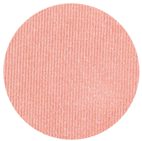
CANDY APPLE EYESHADOW peach w/pink-gold undertone