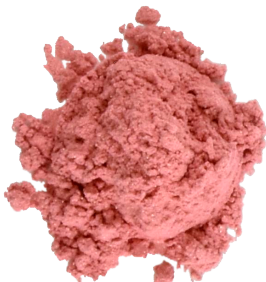
FLAMINGO 1 t. Translucent Modifier 1/4 t. Tourmaline 1/4 t. Sunlight Gold 1/4 t. Sand Frost