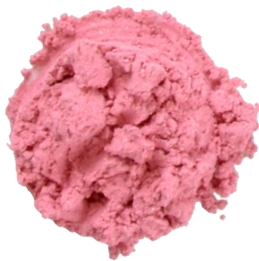
BREEZY PINK 1 t. Alabaster 1/4 t. Tourmaline 1/2 t. Sand Frost