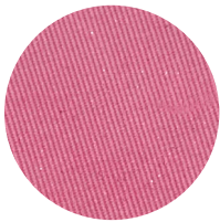
CAMERA READY BLUSH rose pink shimmer