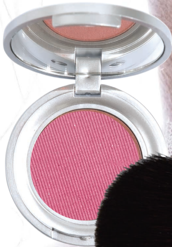
CAMERA READY BLUSH

Not much is needed to recreate this look. One shade of blush or eyeshadow in hues of pink or coral will do. Keep in mind that the cheek is overly exaggerated and is the center of attention with a bit of the same shade swept across the eyelid and over the temples. This trend will give you reason to blush!