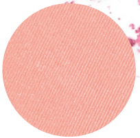
SWEETS BLUSH tangerine w/pink undertone shimmer