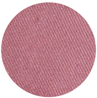
BERRY EXCLUSIVE EYESHADOW pink berry shimmer