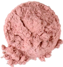
FIFI 1 t. Alabaster 4 tiny Tourmaline 1/4 t. Gold Frost 4 tiny Garnet Frost

Colors may vary due to monitor settings and devices.