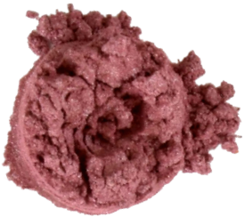
CHARMING ROSE 3/8 t. Tourmaline 3/8 t. Amethyst 3/4 t. Champagne Frost