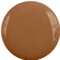
NAUGHTY NUDES Buckskin