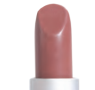
MADMOISELLE medium mauve sheer shiny