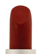
GLAMAZONA red w/ gold flecks sheer shiny