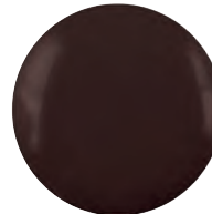
MONKEY BUSINESS Chocolate Brown