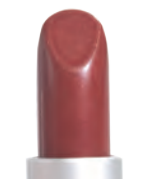
SPLENDID red brown sheer shiny