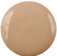
PREP FOR SUCCESS Sheer Butterscotch