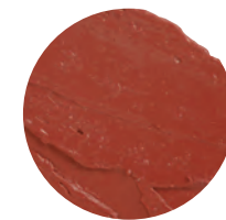
ALLURE Crème Base .50 +.25 Peach .50+ .125 Wineberry .50 Brown .25 + .25 Ochre