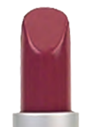
FIREWORKS medium pink brown smooth creamy