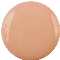
SKY'S THE LIMIT Sheer Sand