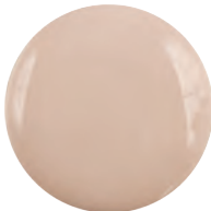
NEW YORK MINUTE Seashell Pink