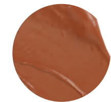
SUN VALLEY Crème Base .50 +.50 +.25 Cocoa .25 +.25 +.25 +.25 Crimson .50 +.50 Peach .25 +.25 Mahogany 1 tiny scoop Garnet Frost

Colors may vary due to monitor settings and devices.