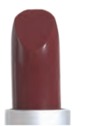
FRANKLY SCARLET burgundy smooth creamy