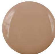
LIFE IS CRAZY Light Honey