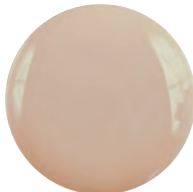
TAKE COVER Lt. Camel