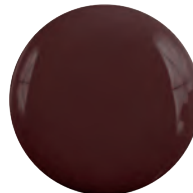
THE DARK SIDE Raisin