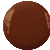
BROWNIE POINTS Rich Toffee