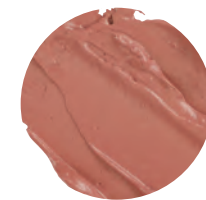
SHY ONE Crème base .50 +.50 Peach .50 +.25 Magenta .50 +.25 +.125 Mahogany .25 +.125 Sapphire .25+.125 Ochre .125 +.125 Blueberry