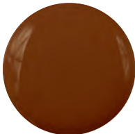
DAMAGE CONTROL Fig