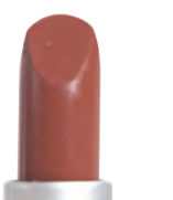
LET'S DO LUNCH neutral café au lait smooth creamy