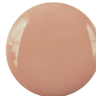
JUST BETWEEN US Peachy Nude