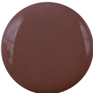
BERRY BAD Eggplant