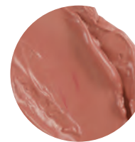
ANGEL KISS Crème Base 1.0 Mahogany 1.50 Peach 2 drops Wineberry