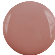
DRESSED TO IMPRESS Sheer Blush