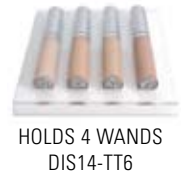
HOLDS 4 WANDS DIS14-TT6