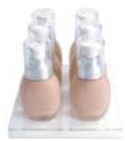
HOLDS 6 SUPERIOR PERFORMANCE DIS14-TT7

The showcase display can hold 4 large templates, 6 small templates, or 8 tiny templates, or a combination of each.