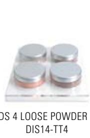
HOLDS 4 LOOSE POWDER JARS DIS14-TT4