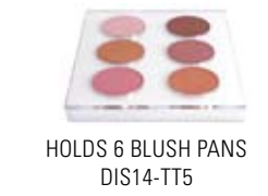
HOLDS 6 BLUSH PANS DIS14-TT5