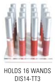
HOLDS 16 WANDS DIS14-TT3