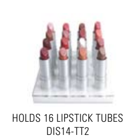
HOLDS 16 LIPSTICK TUBES DIS14-TT2