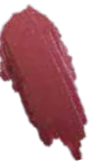
OPPOSITES ATTRACT Crème base 1.50 Mahogany .50 Wineberry .25 Blackberry 2 drops Blueberry 3 small scoop Opal Frost 3 tiny Brass Frost 6 drops Silkening Modifier