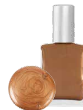
ALL THAT GLITTERS IS NOT GOLD gold metallic

Colors may vary due to monitor settings and devices.