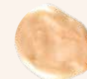
DEW DROPS MOONSTONE soft gold