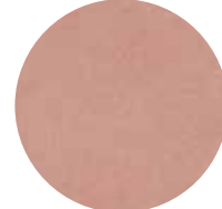
NICE TAN cooled bronze