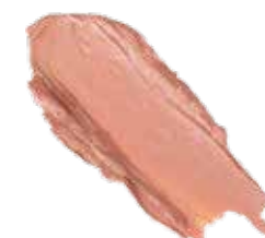
DESIRE Crème Base .125+.125 Mahogany +1 drop .50 Peach .125 Coral .125 Ochre .125 Cocoa 2 tiny Coral Frost 4 tiny Champagne Frost 3 tiny Crystal Frost 6 drops Silkening Modifier