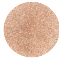
GLISTEN UP! HIGHLIGHT soft beige