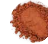
COLOR BOMB ¾ † Sunstone ¼ † Gold Frost ½ † Med. Mineral Powder