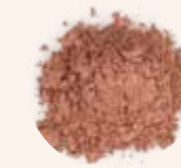
LOW KEY 1½ † Translucent Modifier ⅛ † Rubellite 2 tiny Dark Mineral Powder 1 tiny Sunstone 4 tiny Agate 2 tiny Sienna Frost