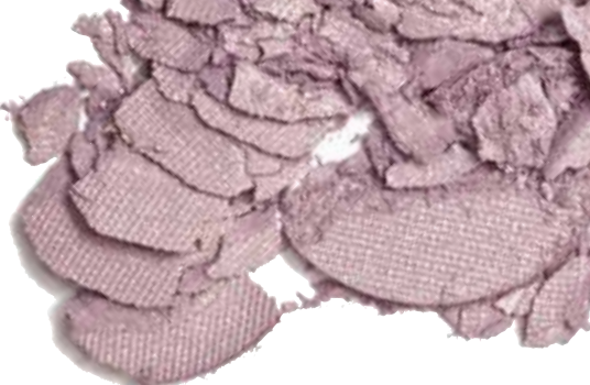
FAIRY DUST pale lavender w/ gold sparkle