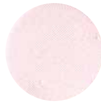
CHAMPAGNE light pink