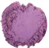
OVER THE RAINBOW ¾ † Violet Frost ½ † Translucent Modifier ⅛ † Azurite Frost 2 tiny Matte Red Color Adjuster 2 tiny Lapis