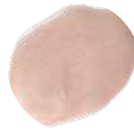
DEW DROPS QUARTZ natural