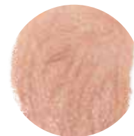
ON THE EDGE 20 pumps Fringe Benefit 4 pumps Pearl 4 tiny Champagne Frost 3 tiny Crystal Frost