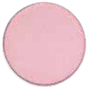
INGENUUE pale pink shimmer