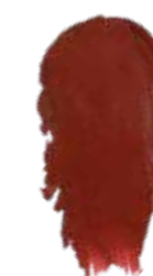
PAINT THE TOWN Crème Base .50 +.50 Paprika .50 Brown .25 +.25 Mahogany 1 small Pink Gold Frost