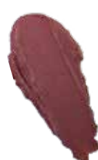
PERSONAL TOUCH Crème base .25+ .25 Wineberry 1.0 Peach .50 Brown + .25 .25 Mahogany + .125 +.125