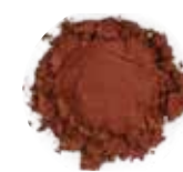
MERCURY RISING ¼ + ⅛ † Agate ¾ † Russet Frost ⅛ † Sunstone + 4 tiny 4 tiny Copper Frost