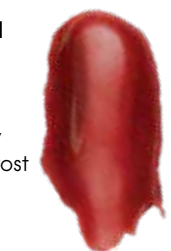
RED HOT Glacé Base 5 drops Red Red 3 tiny Russet Frost 1 drop Blackberry .25 Body Builder