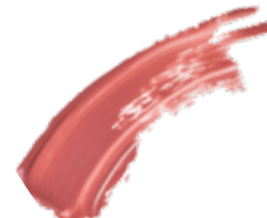
HUGS AND KISSES mauve