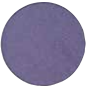
A LITTLE MAGIC deep plum