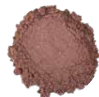
NAUGHTY ½ t Lt. Mineral Powder ¼ t Rose Quartz ½ t Agate ½ t Champagne ½ t Onyx 4 tiny Brass Frost 3 tiny Garnet Frost 3 tiny Violet Frost 2 tiny Opal Frost 3 tiny Amber