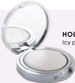
HOLIDAY CRÈME LUMINIZER Icy pearl base with soft pink shimmer