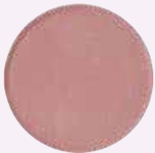
ANTIQUE ROSE matte rosy plum