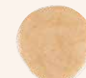
GOLDEN TOUCH 20 pumps Fringe Benefit 4 pumps Pearl 4 tiny Gold Frost 1 tiny Sand Frost