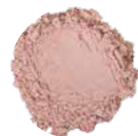
BEAUTIFUL LIFE 1 t Lt. Mineral Powder ¼ t Rose Quartz ½ t Champagne Frost ½ t Alabaster