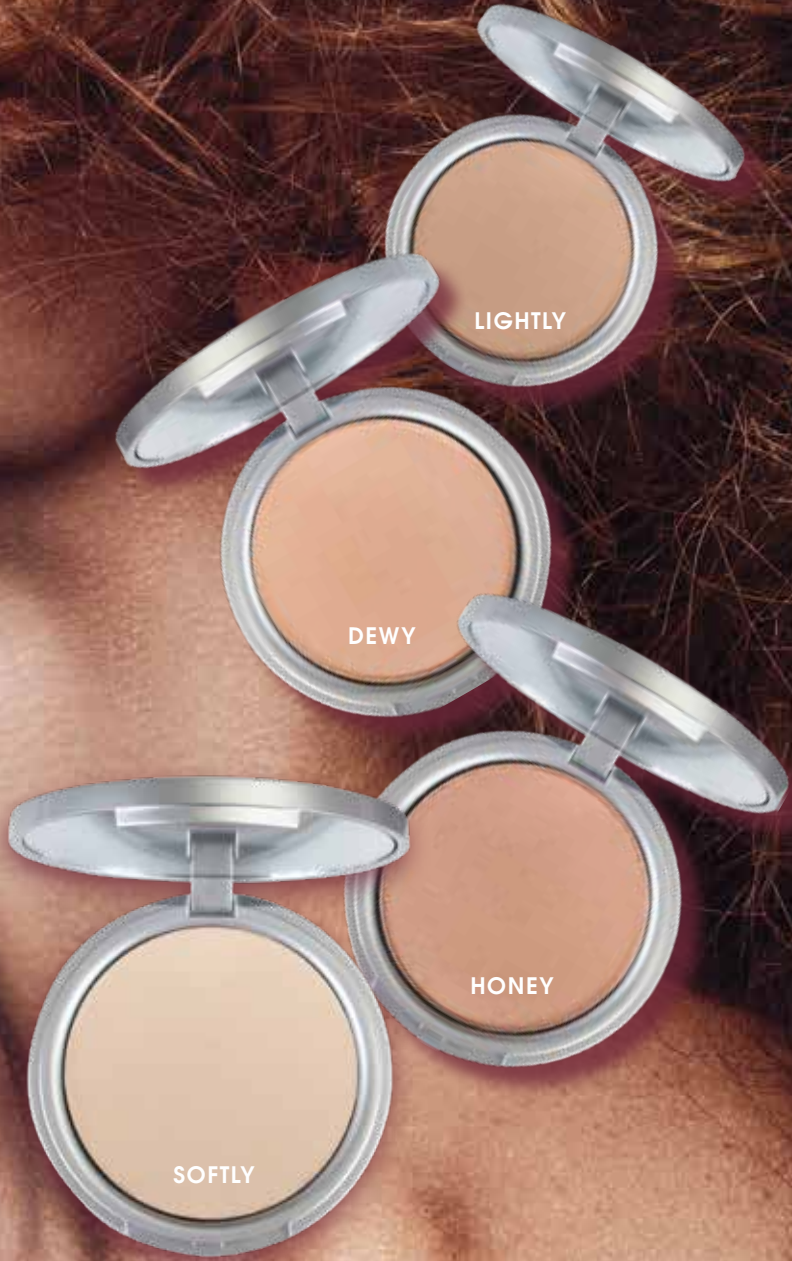
Colors may vary due to monitor settings and devices.

INGREDIENTS: Mica, Talc, Silica, Octyldodecyl Stearoyl Stearate, Zinc Stearate, Cetyl Dimethicone, Phenoxyethanol, Sodium Benzoate. May Contain +/-: Mica (CI 77019), Titanium Dioxide (CI 77891), Iron Oxides (CI 77491, CI 77492, CI 77499).