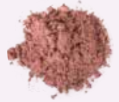
CROWNING GLORY ½ † Rose Quartz ½ † Light Mineral Powder ¼ † Alabaster ⅛ † Rubellite 4 tiny Tigers Eye 1 tiny Matte Red Color Adjuster 1 tiny Onyx