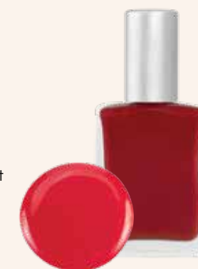
MY OLD FLAME brick red