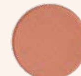
ADOBE matte / peach brown