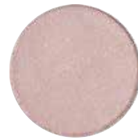
TRUFFLE taupe w/golden pink undertone