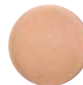
ENVY med. delicious brown