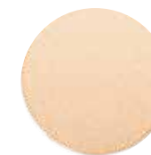
GAZE whitened peach