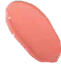
LEAP OF FAITH Liquid Matte Base .125 Wineberry + 2 drops .25 Brown .50 +.50 Peach .25 Ochre .125 +.125 Red Red