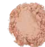
WHY NOT? 1 † Translucent Modifier ¼ † Sand Frost ⅛ † Champagne Frost 2 tiny Pink Gold Frost