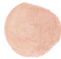
DAY DREAM 20 pumps Fringe Benefit 4 pumps Pearl 4 tiny Champagne Frost