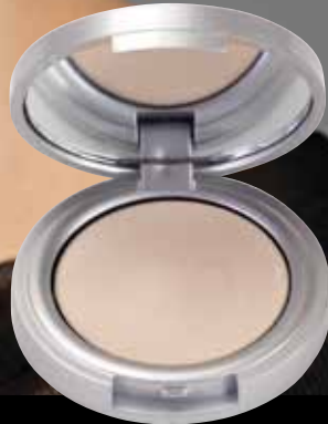
EYELIGHTS PRIMER ray of light & spotlight