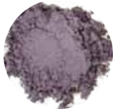
TO THE MAX 1 † Translucent Modifier ⅛ † Lapis ⅛ + ¼ † Onyx 4 tiny Matte Red Color Adjuster 2 tiny Matte Blue Color Adjuster