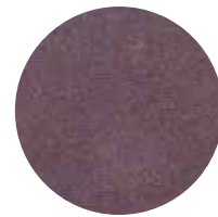
BRANDIED WINE bronzed plum