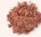
UPGRADE ½ † Translucent Modifier ½ † Lt. Mineral Powder 4 tiny Copper Frost ⅛ † Agate ⅛ † Sunstone ⅛ † Pink Gold Frost