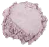
DELICATE MATTER ¾ † Alabaster ¼ + ⅛ † Pink Gold Frost ⅛ † Silver Frost + 5 tiny