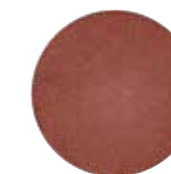
CHOCOLATE VELVET brown shimmer