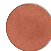
FRESCO med. golden copper