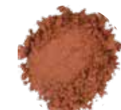
GAME ON ¼ † Agate ¼ † Sunstone 1 † Translucent Modifier