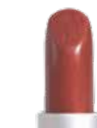
KNOCK OUT red brick shimmer