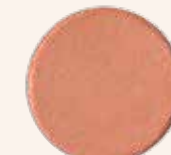
SIENNA peach brown w/ gold flecks shimmer