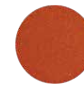
EXOTIC SUN bright orange w/ gold flecks