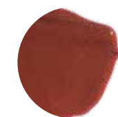
URGE TO SPLURGE brick red shimmer