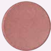
BARELY PLUM mauve plum shimmer