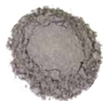
NIGHT OWL ¼ t Lt. Mineral Powder ½ t Onyx ¼ t Alabaster ½ t Crystal Frost ½ t Bronze Frost ½ t Jade 2 tiny Diamond Dust