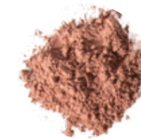
GORGEOUS 1 t Translucent Modifier ½ t Lt. Mineral Powder ½ t Rose Quartz 3 tiny Agate 4 tiny Sienna Frost 1 tiny Sunstone 1 tiny Bronze Frost