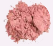
BEST GUESS ½ † Garnet Frost ½ † Med. Mineral Powder ¼ † Translucent Modifier ⅛ † Sienna Frost 2 † Bronze frost