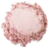
WHO ME? ¾ † Alabaster ¼ † Rose Gold Frost ⅛ † Rubellite ⅛ † Crystal Frost ¼ † Champagne Frost