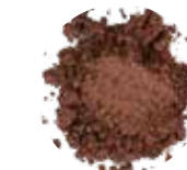
NEUTRAL ZONE ½ † Translucent Modifier ½ † Bronze Frost + 3 tiny ⅛ † Copper Frost 2 tiny Antique Gold Frost 1 tiny Onyx