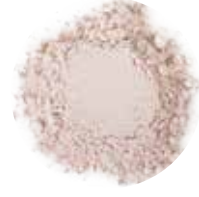
ENCHANTED ½ t Translucent Modifier 2 tiny Rose Quartz ¾ t Alabaster ¼ t Crystal Frost 1 tiny Pink Frost