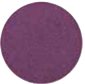
WISTERIA med. purple w/ shimmer