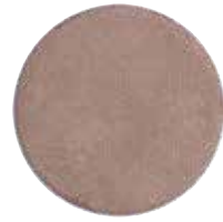
MYSTICAL light silver grey