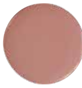
LAZY AFTERNOON cool light pink