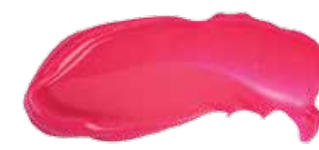
ELECTRIC AVENUE Sheer intense pink with opal undertones