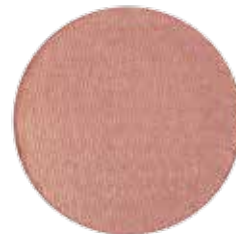
CELESTIAL soft pink with gold frost