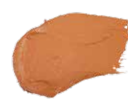
MOCHA dark yellow beige