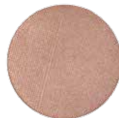
SOLSTICE neutral shimmering beige