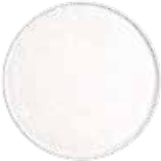
ICE (COOL, WHITE)

Shades of violet combined with silvery-white makes a strong impact. This colorful, smoky look is sensual, dark and dramatic. Wear it soft in the day and layer it for a more intense look for the evening. Expressive and gorgeous, this color palette is a true standout and will compliment any skin tone.