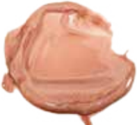
MISS MELROSE LIP GLOSS (NEUTRAL, BERRY SHIMMER)