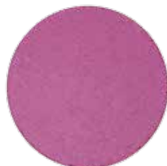
VIOLET RUSH intense pink with opal frost undertone