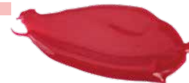
PRETTY PLEASE sheer deep berry

Ultra high shine gloss that can be worn alone for a sheer shine or layered on top of lipstick for a beautiful lacquered effect.