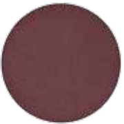
PRIVATE SHOWING (NEUTRAL, BLACKBERRY MATTE)