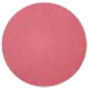
BLISSFUL (COOL, BERRY SHIMMER)