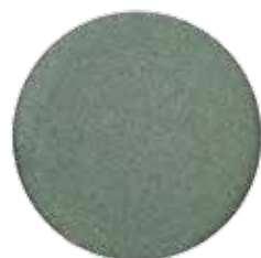
GREEN WITH ENVY deep teal green with gold flecks