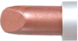
SHOWOFF LIPSTICK (WARM, CHAMPAGNE SHIMMER)