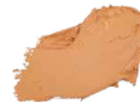
HONEY medium yellow beige

Lightweight, creamy, talc-free, Vitamin E infused and crease proof. Wise Disguise™ is formulated with a potent anti-inflammatory, cell renewal, and healing agent Centipedia Cunningham which is native to Australia and has been used by the Aborigines for years. Both shades are yellow based and round out the entire collection. Honey is one shade darker than Natural and Mocha is one shade darker than Tawny.