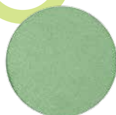
CHARTREUSE light shimmer green

Luxuriously silky pressed eye shadows that glide on smoothly for long lasting, crease-proof color that are made from pure micronized minerals.