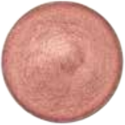
STARLIGHT GLISTEN-UP (SOFT PINK)