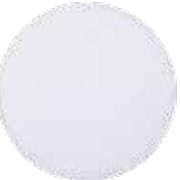
SUGAR (COOL, LIGHT SILVERED WHITE)