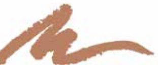
TWIG SKETCH STICK® LIP PENCIL