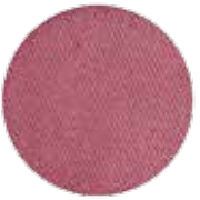
BERRY EXCLUSIVE (COOL, PINK BERRY SHIMMER)