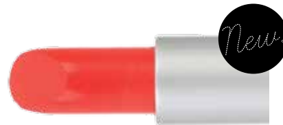
MAI TAI LIPSTICK (RTW ONLY IN FLORIDA)