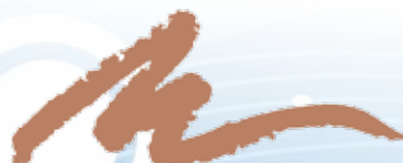
SUEDE SKETCH STICK™ LIP PENCIL SOFT TERRA COTTA