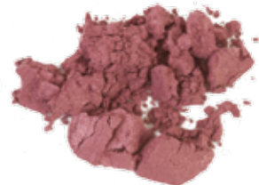
SUNSET PINK EYE SHADOW (RTW PINK WHISPER)