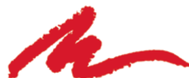
BLOSSOM SKETCH STICK™