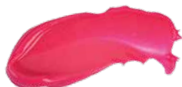
TROPICAL SPLASH LIP GLOSS (RTW ELECTRIC AVE)