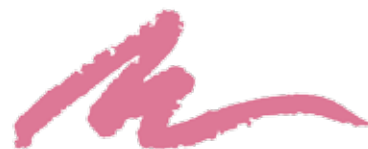
SORBET SKETCH STICK™ LIP PENCIL BLUE PINK