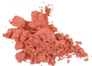
ADRIFT (RTW ECSTASY)