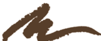
SOFT BROWN LUXURY GEL EYE LINER