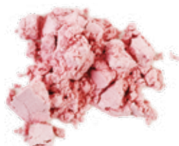
CONCH SHELL EYE SHADOW (RTW BABY DOLL)