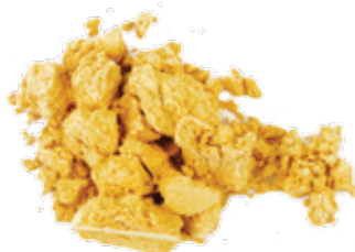
SUN SPOT EYE SHADOW (RTW LEMON DROP)