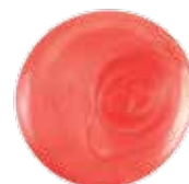
HERE COMES THE SUN