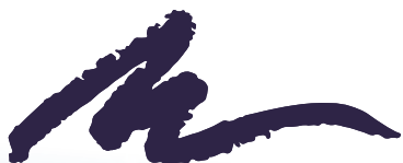
TANZANITE LUXURY LINER GEL