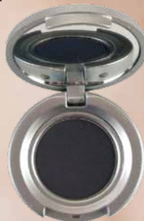
CAKE EYELINER - CHARCOAL

up to get in on this trend. Well-played cat-eyes, thick winged liner to delicate winged corners have all angles of this trend covered.