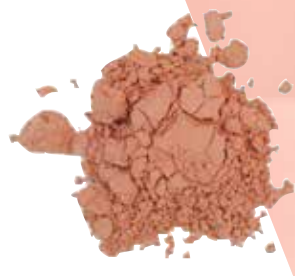
PEACH SUEDE muted peach matte