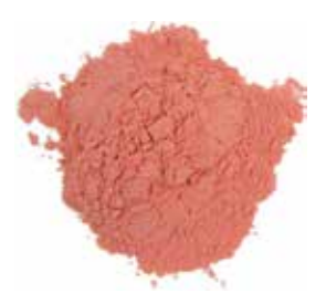
FRESH PEACH light coral peach matte