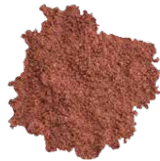
GLAZED PEACH deep terracotta with deep warm peach tones