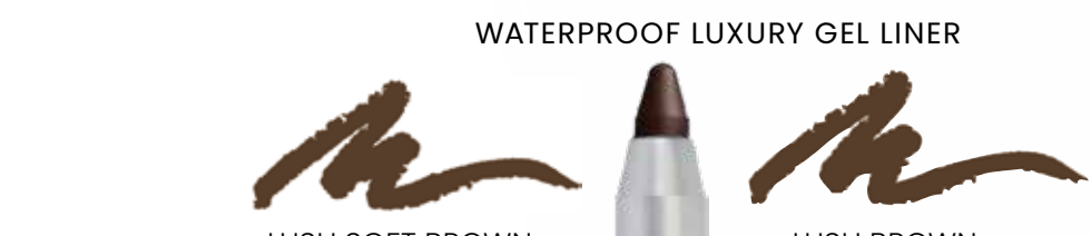
WATERPROOF LUXURY GEL LINER

Waterproof Gel Eyeliner / CHOCOLATE OPAL NET WT. 0.012 oz. / 0.34 g