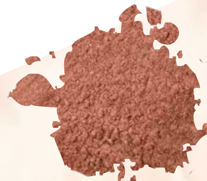
PEACH TRUFFLE deep bronzed coral