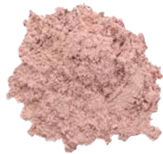
PEACH CHAMPAGNE light neutral beige peach

Our luxurious mineral powders are made exclusively from micronized minerals. They provide long-lasting coverage with a lightweight natural look and feel. Their exceptional adherence and crease resistance keeps makeup looking fresh all day. The natural pigments easily adhere to the skin, which gives our mineral powder its long-lasting effects.