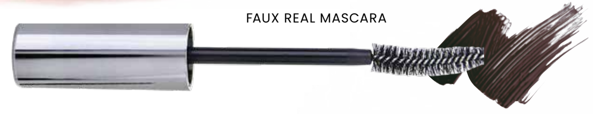
FAUX REAL MASCARA