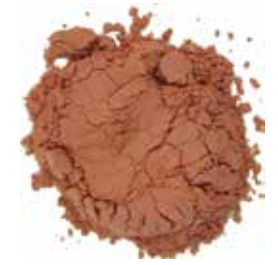
ADOBE peach brown matte

WE'VE CHOSEN A COLLECTION OF READY TO WEAR items that reflect the versatile hues inspired by the Pantone of the Year: PEACH FUZZ . The range of shades communicates a warm, luxurious, and comforting feel for eyes, cheeks and lips.