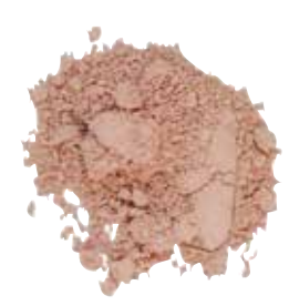
CREAMY PEACH peach pink matte