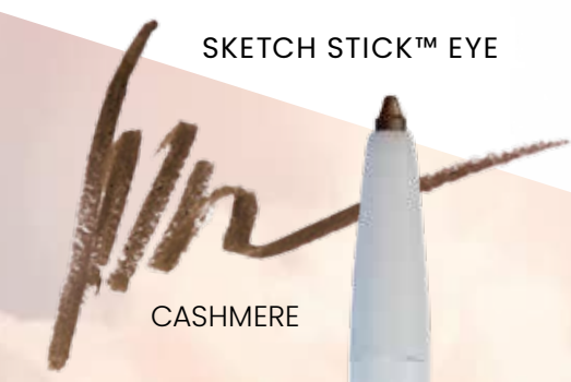
SKETCH STICK™ EYE