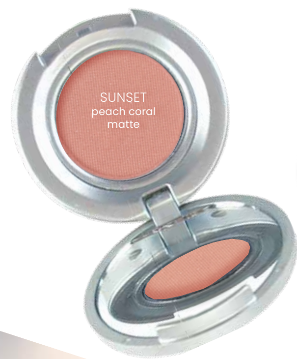
SUNSET peach coral matte