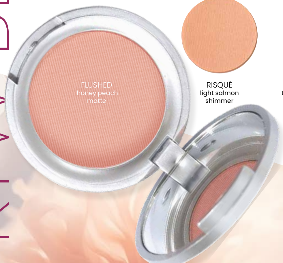
FLUSHED honey peach matte