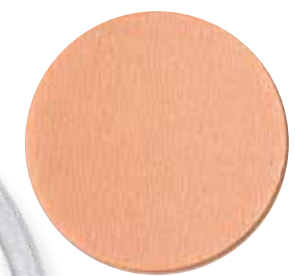
RISQUÉ light salmon shimmer