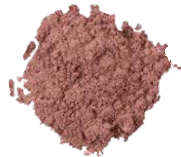
OUT PEACHED medium muted coral