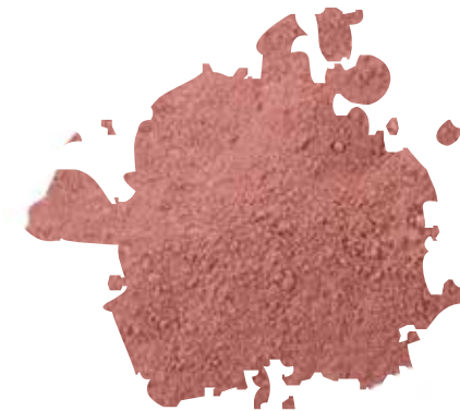
PEACH TOFFEE medium coral beige