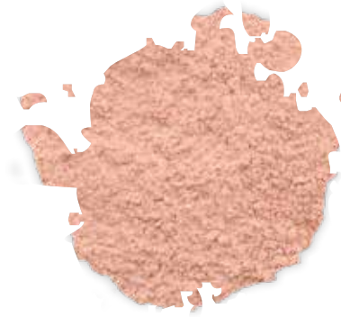
LOVE, PEACE AND PEACH light peach w/ beige undertones