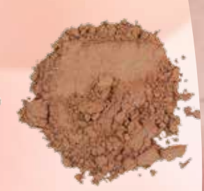
TOFFEE peachy tan matte