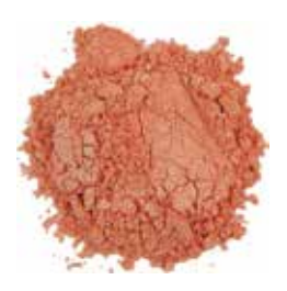
SWEETS tangerine w/pink undertone shimmer