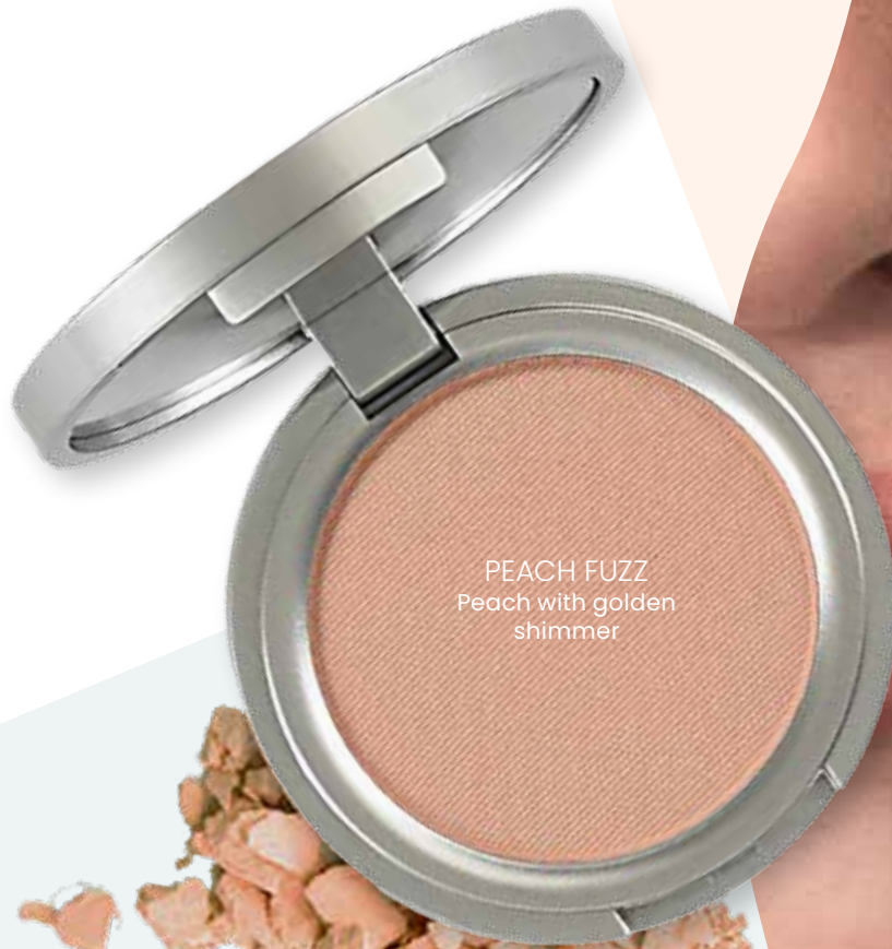
PEACH FUZZ Peach with golden shimmer

P each Fuzz is the perfect multi-tasking product that makes getting ready quick and easy. The no fuss, universally flattering shade that can be worn as blush, bronzer, eyeshadow or even a lip tint (add a little gloss over it and voilà!).