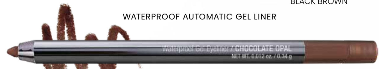
WATERPROOF AUTOMATIC GEL LINER