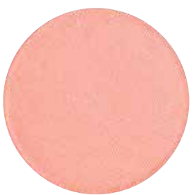
SWEETS tangerine w/pink undertone shimmer