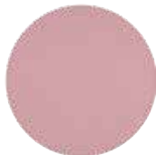
IN THE PINK