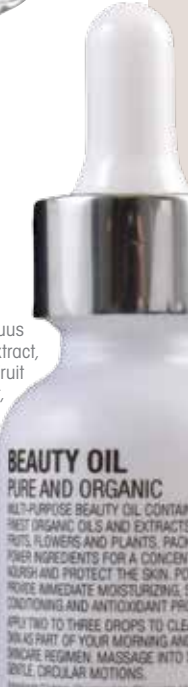
BEAUTY OIL PURE AND ORGANIC

MULTI-PURPOSE BEAUTY OIL CONTAINS THE FINEST ORGANIC OILS AND EXTRACTS FROM FRUITS, FLOWERS AND PLANTS. PACKED WITH 15 POWER INGREDIENTS FOR A CONCENTRATED BOOST TO NOURISH AND PROTECT THE SKIN. PROVIDES IMMEDIATE MOISTURIZING, SOFTENING, CONDITIONING AND ANTIOXIDANT PROTECTION. APPLY TWO TO THREE DROPS TO CLEAN, DRY SKIN AS PART OF YOUR MORNING AND EVENING REGIMEN. MASSAGE INTO SKIN WITH GENTLE, CIRCULAR MOTIONS.